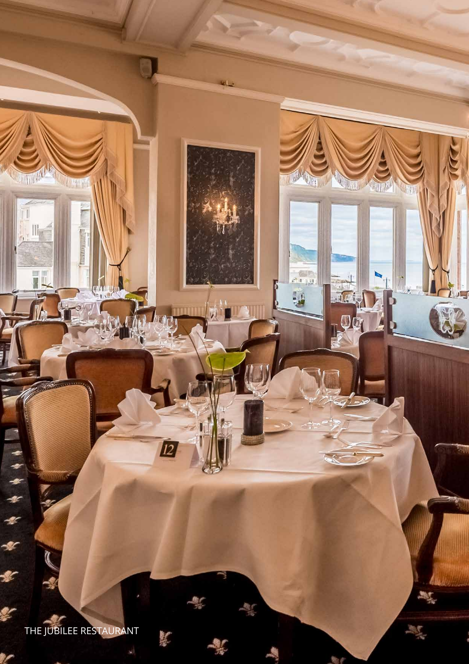
THE JUBILEE RESTAURANT